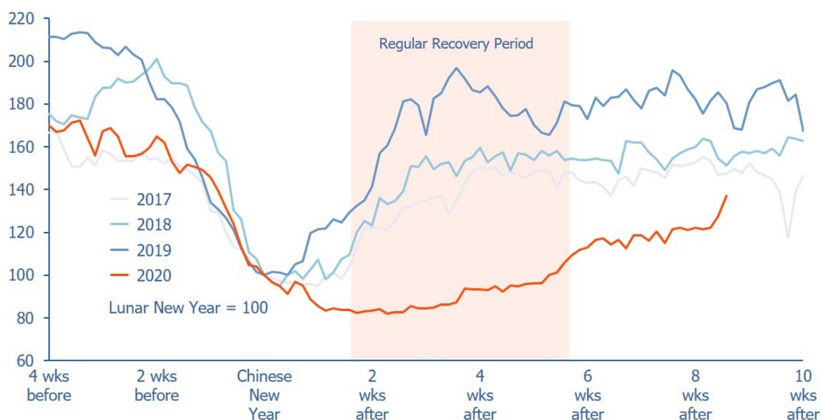
Chart 2: China's Power Plant Coal Consumption